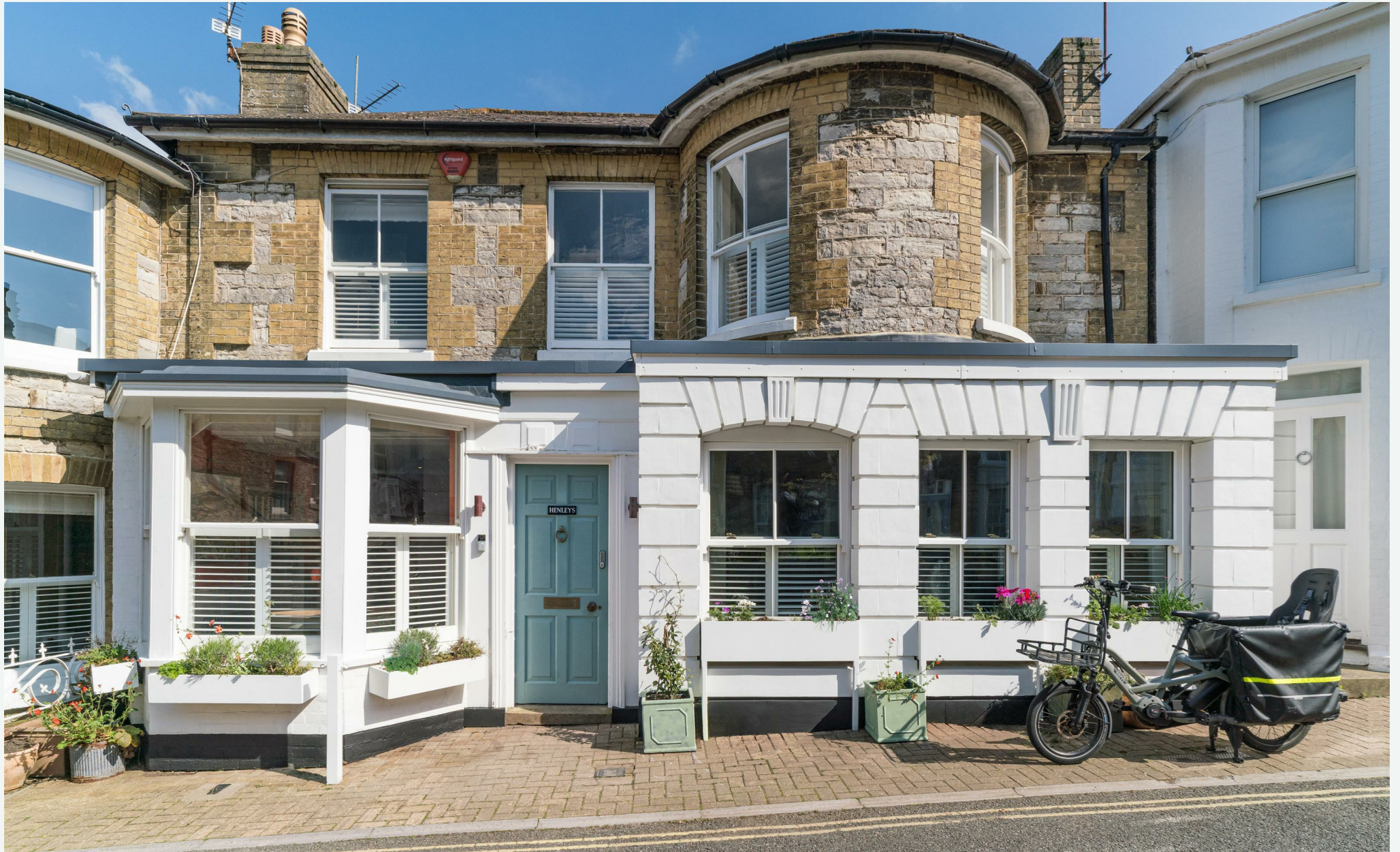
Henleys, High Street, Seaview, PO34 5EU